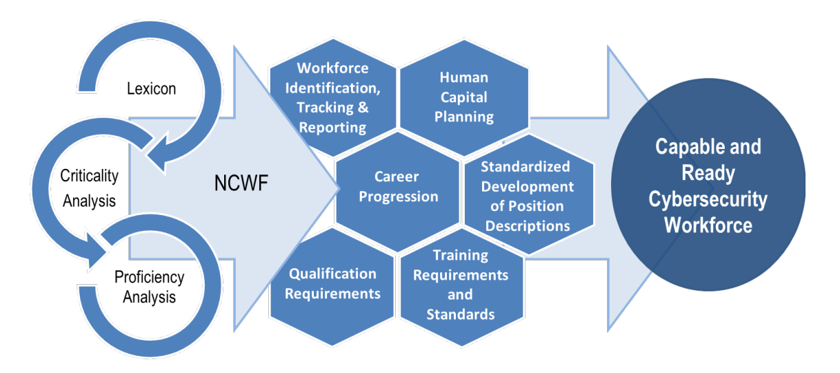
Figure 1 illustrates how the NCWF helps to build a strong cybersecurity workforce.